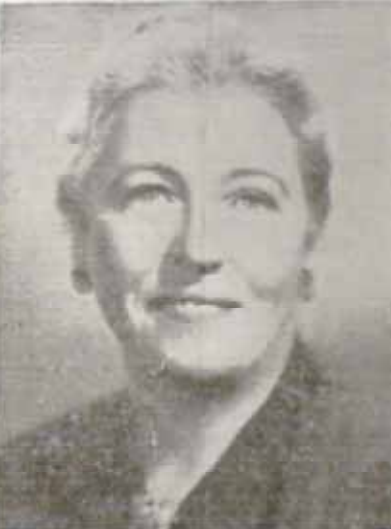
PEARL BUCK... Turns Out Her 17th Novel

It was a busy experience. Her first job was at the home of where the girls learned to write and her first job as a nurse in a hospital. Her first job as a nurse in a hospital.